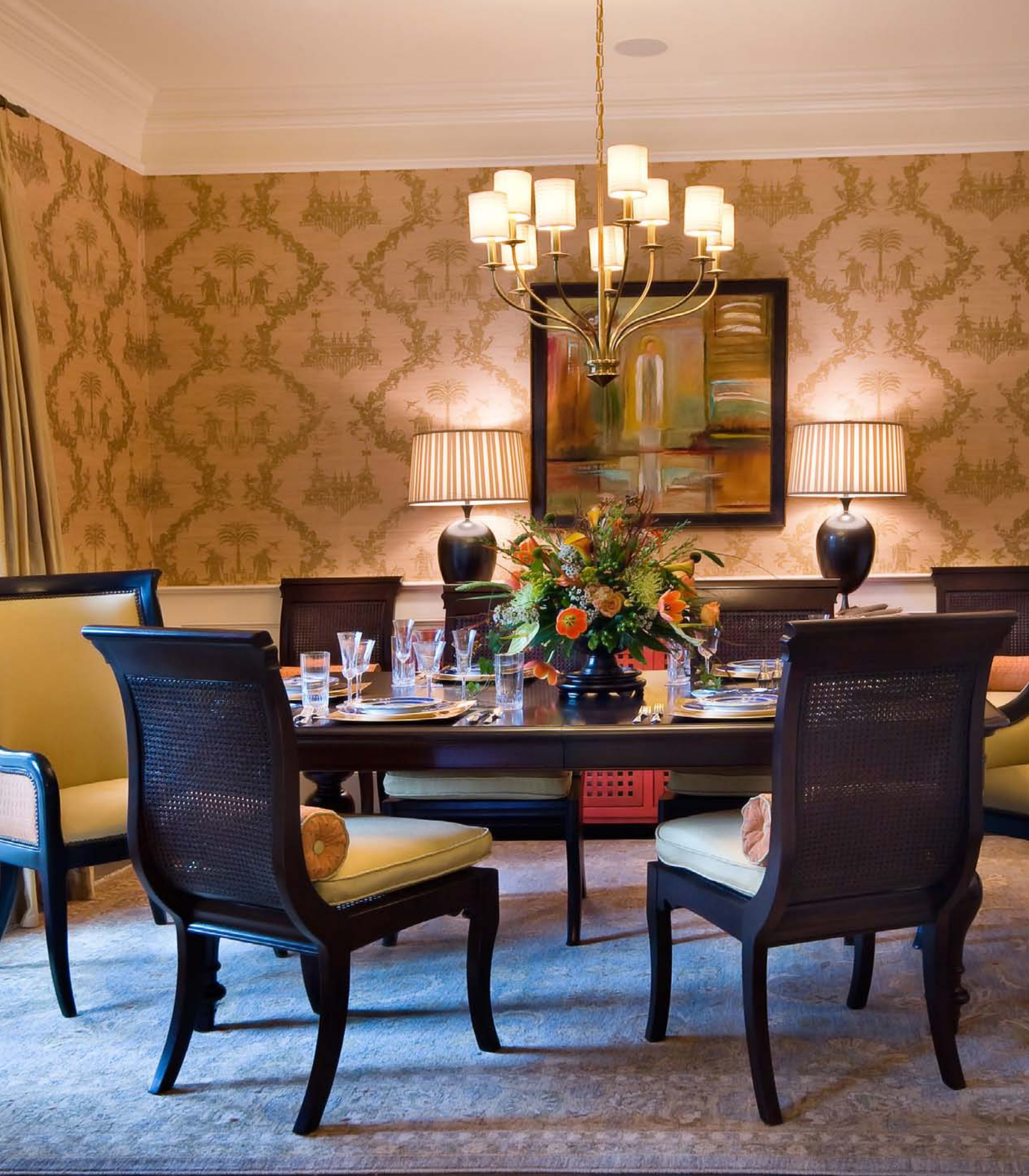
In the dining room, Lorraine created a chic, transitional style by offsetting the traditional architectural elements with Brunschwig & Fils Asian motif silk-screened grasscloth wallcovering and a mandarin lacquered buffet.