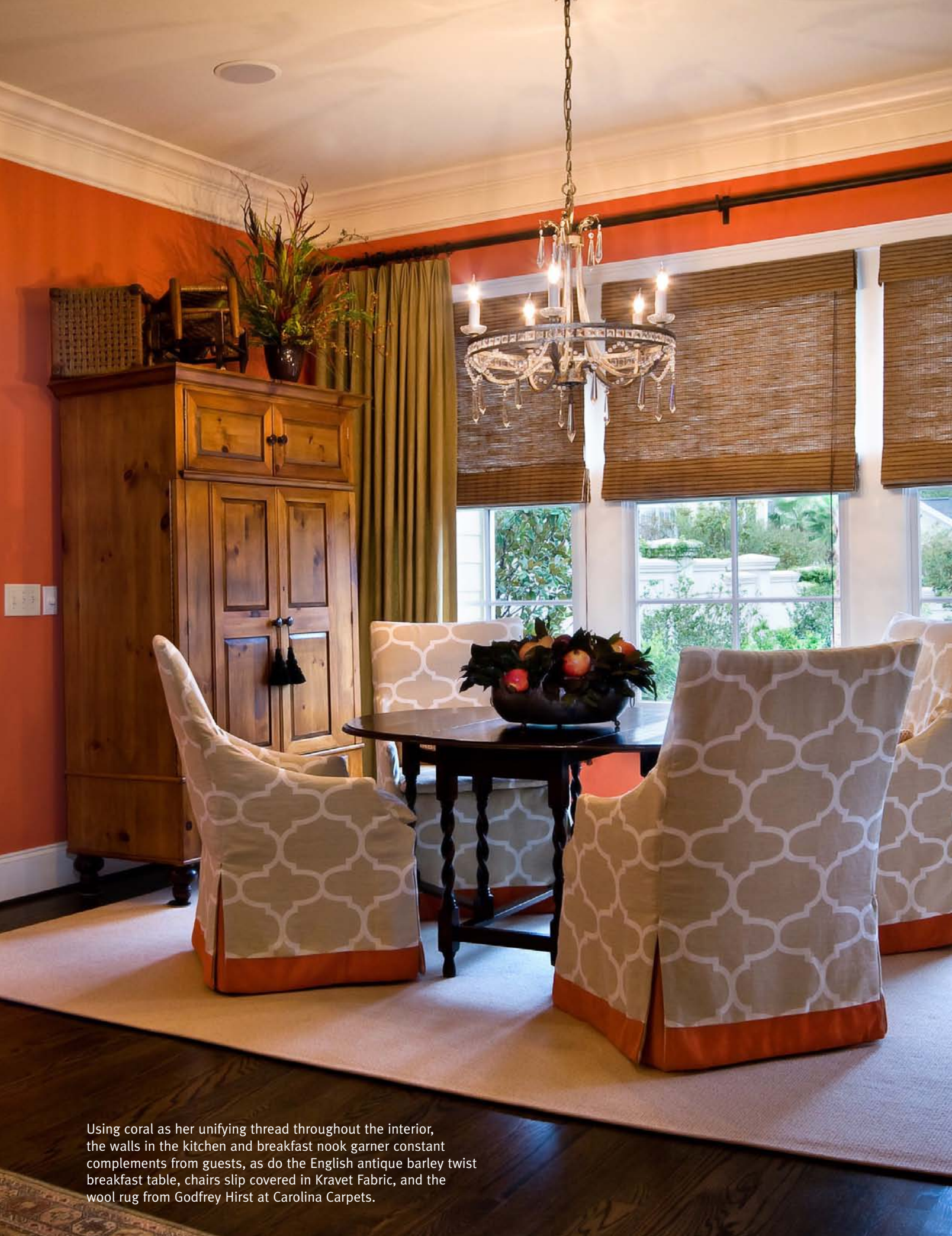
Using coral as her unifying thread throughout the interior, the walls in the kitchen and breakfast nook garner constant complements from guests, as do the English antique barley twist breakfast table, chairs slip covered in Kravet Fabric, and the wool rug from Godfrey Hirst at Carolina Carpets.