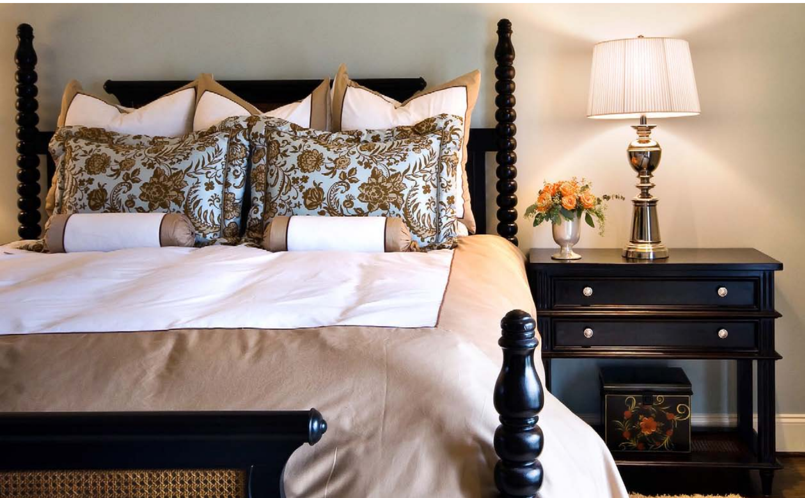
Simple and chic, the master bedroom serves as the designer's sanctuary. Her bedroom furniture is from Postobello Home, Drexel Heritage.